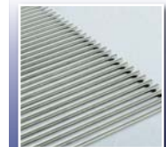
Solid Stainless Steel Cooking Grids