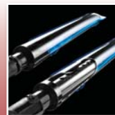
Stainless Steel Dual-Tube™ Burner System